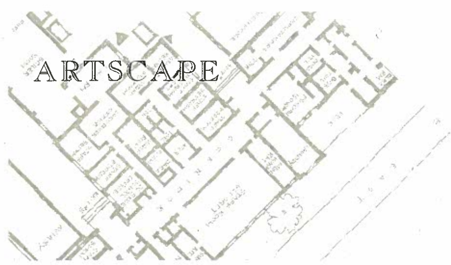
Toronto Artscape Inc.

Note: Applicants do not have to meet all of the criteria in order to be considered "professional"; however, committee members will use the criteria as a guide by which to make the determination of eligibility.