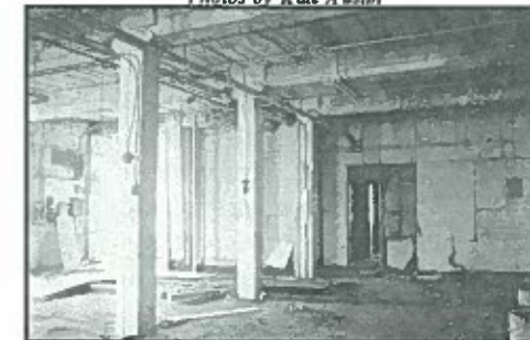
Existing Exterior and Interior 910 Queen St. West