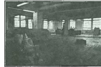
Before: Raw Open Space At 96 Spadina