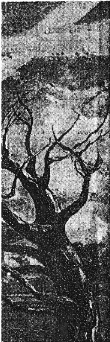
here, its beam lancing out over Murphy, ARCA. York Pioneers ttage, built at the same date.