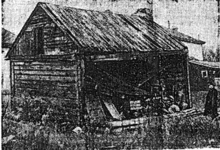
* Badly damaged by storm and wind, the lightkeeper's cottage still stands. This is rear view, showing how recent wind-storm demolished back wall.